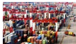
Detainee in China Had Rapid Rise