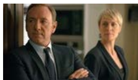
How Corrupt Is the U.S.? Just Watch 'House of Cards,' China Party Arm Says