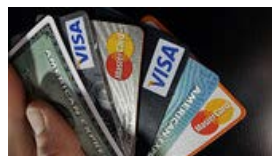
The Three Purchases Worthy of Debt