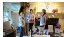
Move Over Avon Lady, the Tweens Are Here