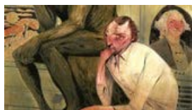
Our Brains Are Made for Enjoying Art